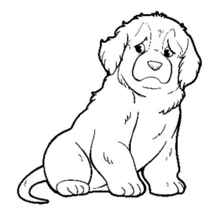
Hey, kids. Draw a picture of me almost chasing Rasputin!